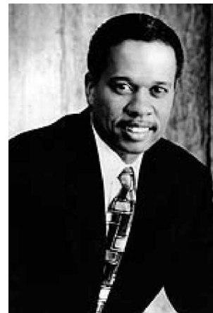
Talk of the Nation host Juan Williams

Redefining the Melting Pot Throughout the twentieth century America was described as a melting pot, a stew and a tossed salad. As we enter the twenty first century the U.S. is more culturally diverse than ever. One out of every ten Americans is now foreign born. And the number of Hispanics, Asians, and Black Americans has never been higher. Many Americans struggle with how large of a role their traditional culture and racial identity should occupy in their daily lives. How do you not let your culture get erased by the American mainstream? Join host Juan Williams and guests for a look at how heightened sensitivity to racial and ethnic identities is changing the concept of American identity. What's happening in the melting pot?